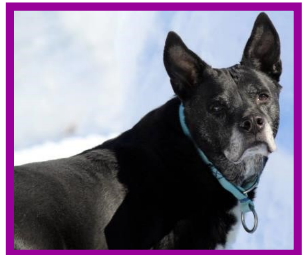
Flip, NLCH's Cyber Pet

The CCHS got us a new dog to sponsor. His name is Flip. He's playful, lovable and full of energy. We heard he likes to play with a rag stuffed mouse. We will see him in a few weeks when we visit the CCHS if he's still there.