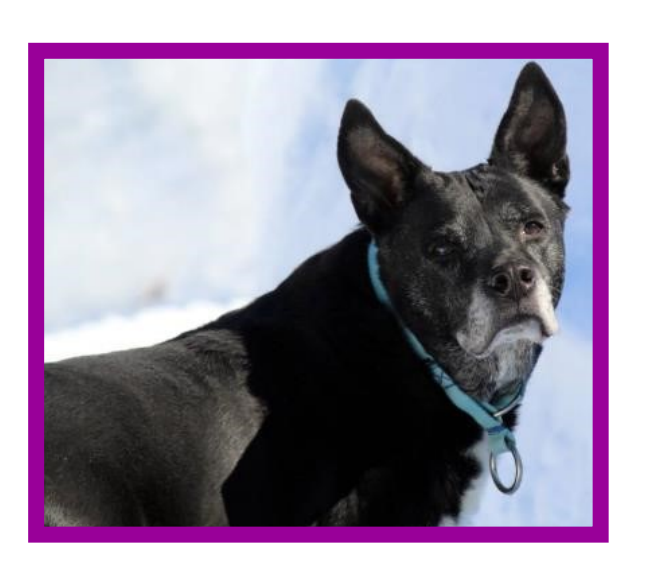
Flip, NLCH's Cyber Pet

The CCHS got us a new dog to sponsor. His name is Flip. He's playful, lovable and full of energy. We heard he likes to play with a rag stuffed mouse. We will see him in a few weeks when we visit the CCHS if he's still there.